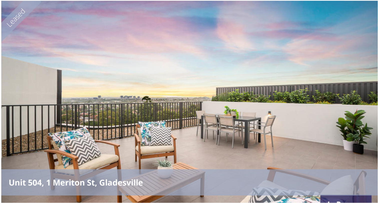
Unit 504, 1 Meriton St, Gladesville