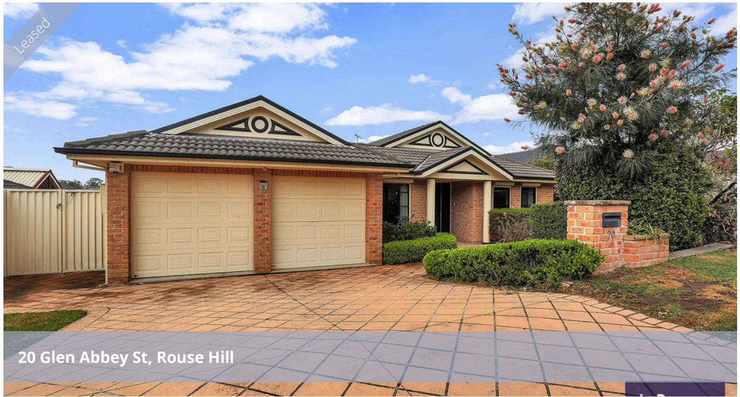
20 Glen Abbey St, Rouse Hill